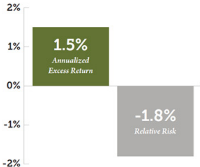
Exhibit 1: U.S. Large Cap Stocks: Firms with Greater Gender Diversity Outperformed with Less Risk