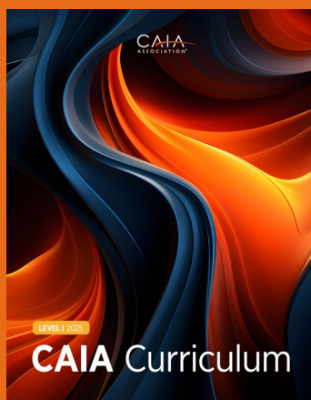
Level I 2025

The 2025 CAIA curriculum materials and CAIA curriculum companions are the only preparation materials endorsed by the CAIA Association and are the candidate's best source of information regarding content eligible for testing on the CAIA exams. All content on the CAIA exams comes directly from the CAIA curriculum readings.