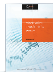
Alternative Investments: CAIA Level I Wiley, 2015.