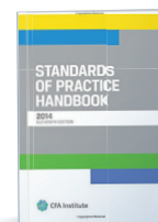
Standards of Practice Handbook 11th edition CFA Institute, 2014