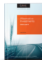
Alternative Investments: CAIA Level II Wiley, 2016