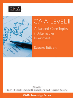
CAIA Level II: Advanced Core Topics in Alternative Investments. Wiley, 2012