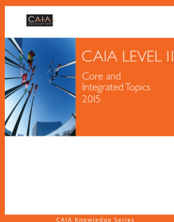
CAIA Level II: Core and Integrated Topics. Institutional Investor, Inc., 2015.